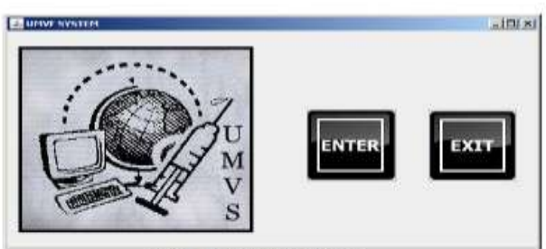
Fig2. The main interface