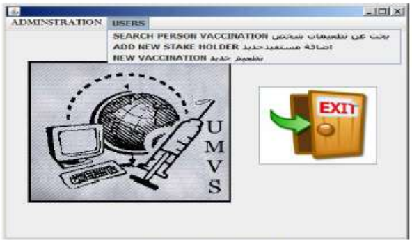
Fig 4. User interface