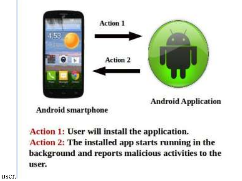
Fig. : Working of Botnet Detection App

We are going to design an application which detects whether the system is a bot or not. The app would also alert the user, which applications are not trusted, if the user clicks OK on the pop message, those untrusted applications would be directly uninstalled. Also a list of trusted and untrusted app would be maintained by the