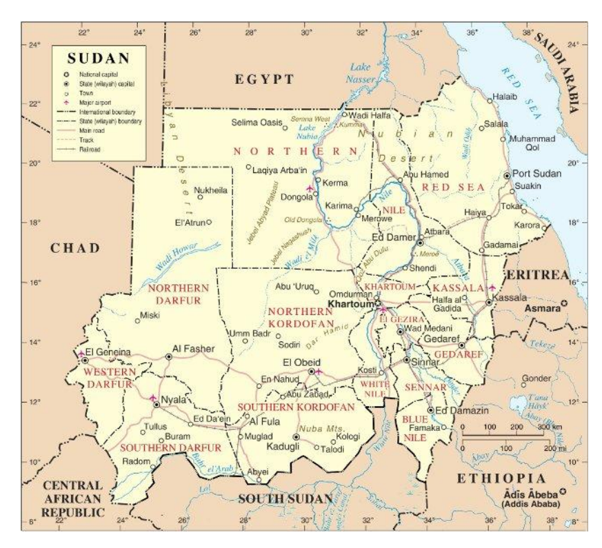
Fig.2 Map of the Sudan with provinces, cities, and path of the River Nile and its tributaries.