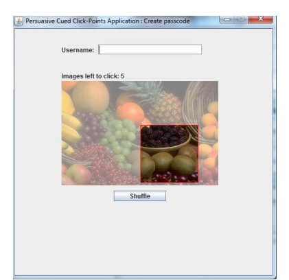
Fig.4. Password creation User interface

viewport, they may press the Shuffle button to randomly reposition the view port. The view port guides users to select more random passwords that are less likely to include hotspots[2]. A user who is determined to reach a certain click-point may still shuffle until the viewport moves to the specific location.