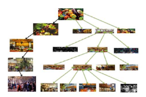
Fig.3 Selection of Click Points in CCP

CCP was developed as an alternative click based graphical password scheme where users select one click-point on each of 5 images presented in sequence, one at a time; this provides one-to-one cueing. Every image next the first is a deterministic function of the current image, the synchronizes of the user-entered click-point, and a user identifier. Users receive immediate feedback if they enter an incorrect click-point during login, seeing an image that they do not identify. At this point they can restart password entry to correct the error. This implicit feedback is not helpful to an attacker not knowing the expected image sequence. In this technique more possibility of hotspot attacks. To overcome this problem a new technique of Persuasive Technology is use .This initiates with selecting of pixels from a sequence of images presented to the user. Further from the first image the selected pixel value[9] generates another image of the same sequence This ensures user's usability but vulnerable to brute force attack