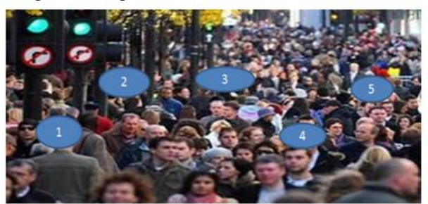
Fig.2 On passpoint, a password consists of 5 ordered points on the image (the numbered labels do not appear in practice)

This technique uses selection of an image and sequencing of pixel in an orderely ,during login the user would remember the sequence of pixel that had entered during the time of creation of password .This makes easier for the attackers to predict the pixels.