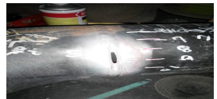
Figure 1:A pipeline showing Crack with measurement

Image shading mainly occurs at the point wherever the pipeline is smooth and deep, because of the oil transportation. This occurs due to the yearlong usage of the pipeline, for carrying the oil.