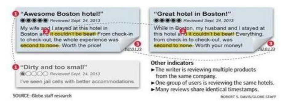
Fig 1: Fake reviews on a hotel

Opinion mining and its importance in the decision making process was explored in [1]. The problem of detecting the spam reviews and classifying them was introduced the same. [5] Describes the procedure of detecting the type 1, type 2 and type 3 reviews mentioned in [1]. [3] Mentions the problems associated in detecting the fake reviews. [6] Relates the challenges in Chinese reviews and detecting Chinese spam reviews. Following method of candidate group formation is found accurate. It is described in the following paragraph. Frequent Item-Set Mining <sup>[8]</sup>: We use frequent item-set mining method to form candidate spammer groups from the database. We can use any well-known algorithm for FIM to form candidate groups. By mining frequent Item-sets, we find groups of reviewers, who have reviewed multiple products together. We assume that, minimum support count is equal to 3 i.e. each group must have worked together on at least three products. Groups with support count lower than three are very likely to be due to random chance rather than true correlation. Each group consist of at least two members i.e. two reviewer IDs per item-set.