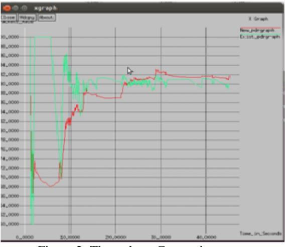
Figure 2: Throughput Comparison

From the above results it is proved that the proposed mechanism is providing better and accurate approach for timely decision making. It also gives the effective results in case of all the three working parameters. Red line is measuring the existing AODV link repair while green line is used to show the proposed TAB-PRRA approach results. It gives the benefitted output. Throughput and packet delivery is high for the proposed approach while for existing it is very low. Also in existing meachnims each time the local or source repair decision has to taken but in this work the decision is always be local repair after the 50% network is crossed out by the packets.