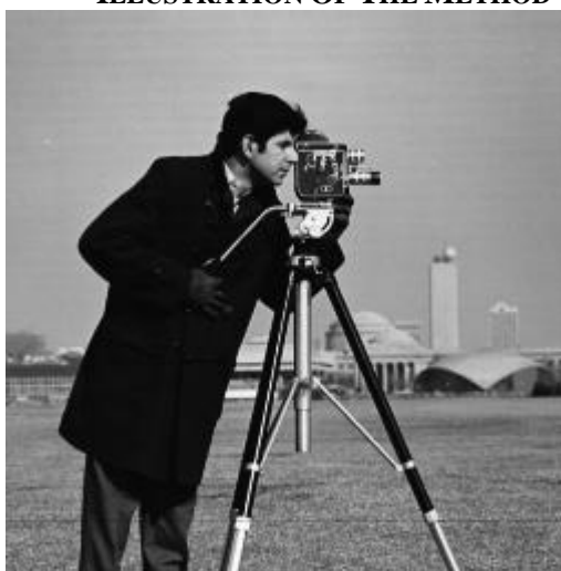
Figure 4.1 Original cover image