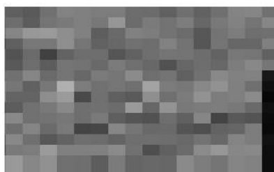
Figure 4.2 Encrypted image before transformation

Due to space constraints, we are displaying only 4 rows of the 256x256 pixel matrix containing the key.