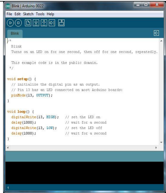
Fig.1: Sample Ardiuino Code