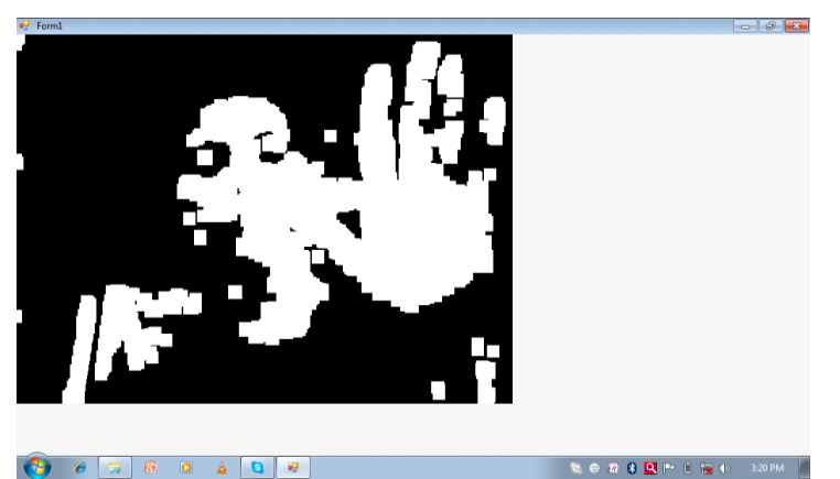
Fig.1. Skin Detection Using Hand Gesture Recognition

In this module we have used a query frame for directly accessing the frame. Along with this grabber is used as an object that grabs the frames. Adaptive Skin Detector is a direct class available in dot net that identifies the skin. Again frame grabber is a function for getting the frames. This module uses Emgu which is a wrapper class of dot net used with Open CV. Open CV is Open Source Computer Vision. It is used as a third party SDK which are used in eye detection, smile detection, skin detection. Software Development Kits are specific, easy to use and understand, accurate and optimized, and it has full hardware support HandGestureRecognition. SkinDetector is used where skin detector is an object. Here the image is taken as the current frame and this current frames' copy is also kept in the image memory. With this the frames' width and height is also taken into consideration. Finally the modified frame is placed into the image box.