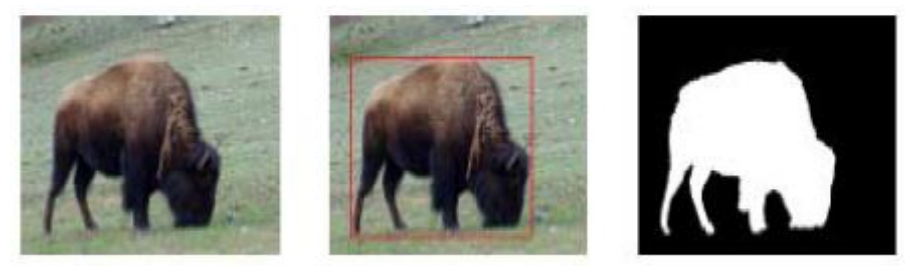
Fig 1: Salient Region Detection

2) Segmenting the accurate boundary of that object or region.