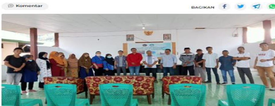
Foto bersama Tim pengabdian masyarakat Politeknik Negeri Ambon dengan staf pemerintah negeri dan pelaku UKM Minyak Seith di Kantor Pemerintahan Negeri Seith, Kecamatan Leihitu Kabupaten Maluku Tengah.

Katamaluku.id-Ambon : Usaha Kecil Menengah (UKM) Minyak Hitam di Negeri Seith, Kecamatan Leihitu, Kabupaten Maluku Tengah banyak diminati oleh kalangan masyarakat di Ambon.