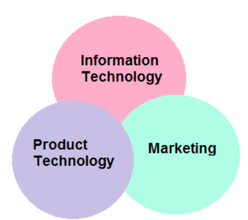
Figure (1) the most intersection in the world

When many sources of information are available, it would be much easier for customers to satisfy their needs based on a competitive price and quality. Marketing technology is not just about making existing processes additional effective. It's the interface by which marketing gets and traces the digital world figure (1).