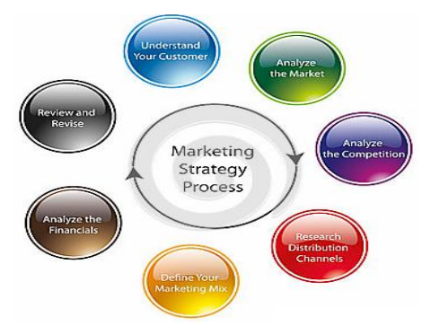
Figure (3) Marketing Strategy Process

Strategy through the marketing cycle note the absence of style and display technology the product to the customer. This is an essential point in any setting strategy for shopping and having great importance to the study of a product display by digital advertising instead of resorting to the use of paper advertisements.