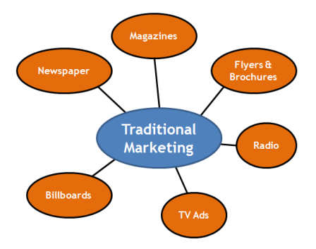
Figure (2) Traditional Marketing

Because of its longevity, people are accustomed to traditional marketing. Finding ads in magazines and newspapers, or reading billboards are still familiar activities and people still do them all the time. Most of the time, traditional marketing is reaching only a local audience even though it is not limited to one figure (2).