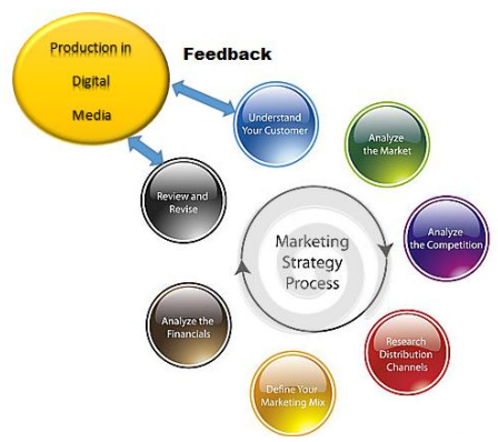
Figure (4) New Model for Marketing Strategy Process

This study added to the model addressing shopping strategy to the process of using digital advertising and linking from both review and revisethe advertising display before starting. On the other hand linked with the customer to understand the product marketer and thus strengthen customer opinion from the goods and the feedback. Which all illustrated in figure (4)