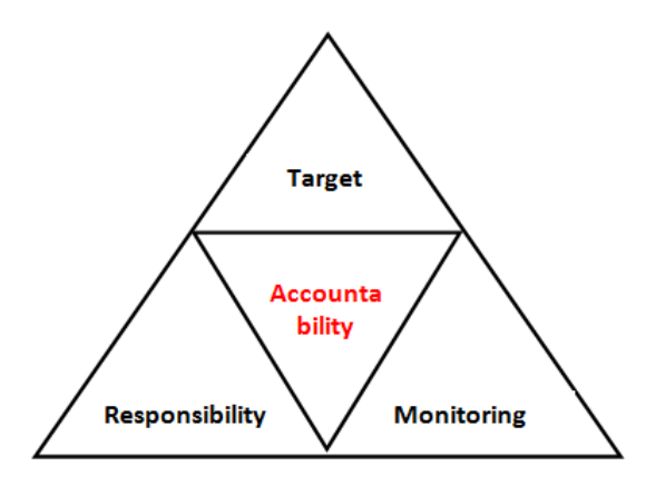
Fig. 2: Theory A Constructs framework.

The four major constructs of Theory A are fixing Responsibility, maintaining Accountability, continuous Monitoring, and fulfilling pre-determined Target (RAMT) and are controlling aspects of the performance/productivity of an employee around the yard stick called Accountability (Fig. 2).