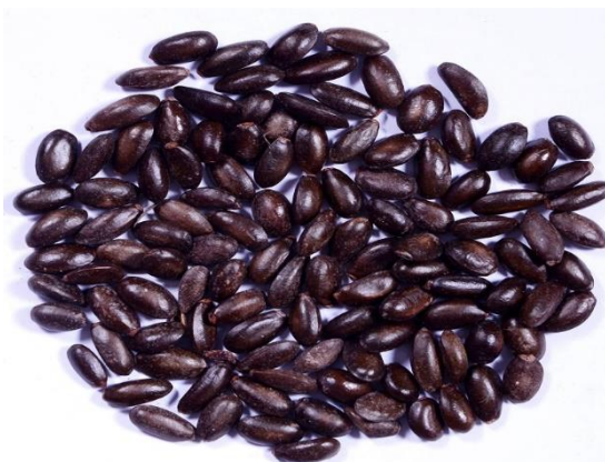
Fig.1.2 Annona squamosa seed