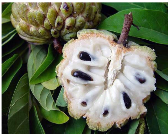
Fig.1.1 Annona squamosa fruit

Traditional medicine has employed Annona squamosa , also known as sugar apple, sitaphal, or custard apple, to cure a number of illnesses, including cancer. Annona squamosa is known to contain bioactive substances that have been discovered to have anti-cancer potential, according to recent studies. Extracts from Annona squamosa inhibit angiogenesis, cause apoptosis in cancer cells, and increase the cytotoxicity of chemotherapeutic medicines. Additionally, Annona squamosa has anti-inflammatory, immunomodulatory, and antioxidant properties that can lessen the negative effects of cancer treatment and enhance the quality of life for cancer patients. This review paper focuses on the properties and chemical composition of Annona squamosa seeds as well as potential future developments in the field of Annona squamosa seed use in cancer treatment.