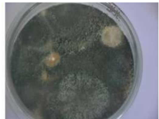
Fig 2. Antagonism test between Rhizoctonia solani pathogens and Trichoderma isolates collected from tidal swamp lands.