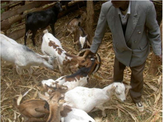
Figue 4. livestock farmer offering home made natural lick block to his goats in Igamatundu Sublocation Igambang'ombe Division