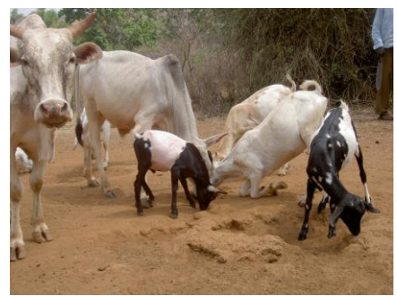
Figure 1. cattle and goats consuming natural lick at Kibuuri site in Kamwimbi Sublocation Igambang'ombe Division