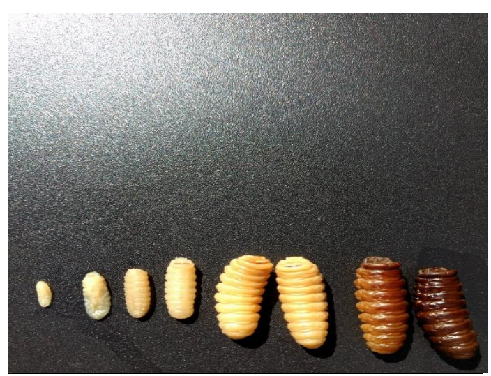
Figure 3. Larval stages L1, L2, and L3.