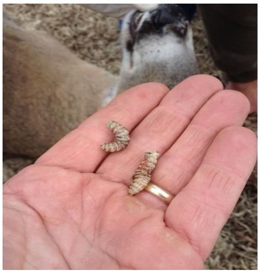
Figure 2. Larvaecollected in paranasal sinuses.