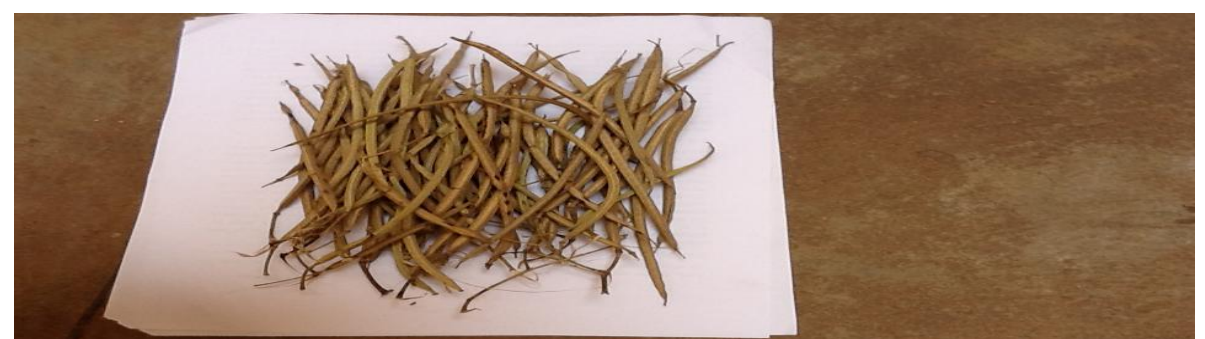
Fig. 8. Number of pods yield (65) of senna obtusifolia plant from medium intra-row spacing of 25cm between plants.