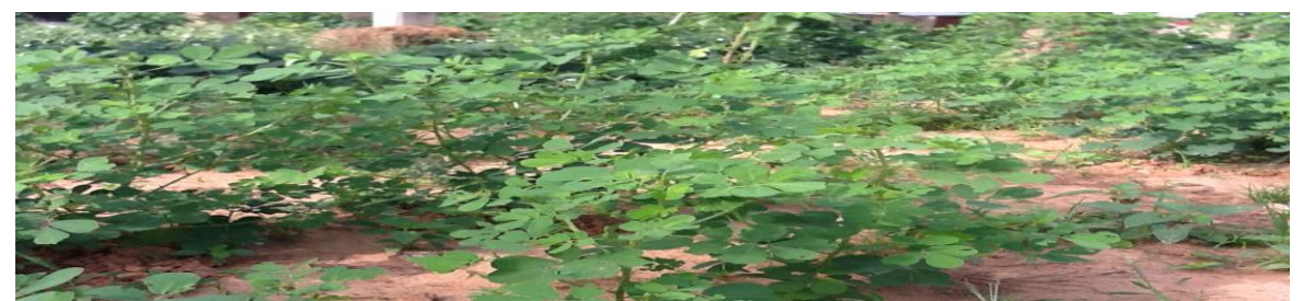
Fig. 5. Job opportunity; Phase (84 days after planting) to harvest senna obtusifolia plant for livestock feed (hay).