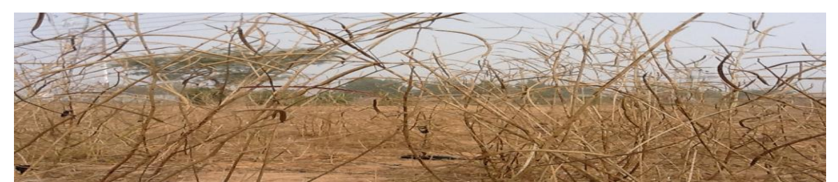
Fig. 6. Job opportunity; Senna obtusifolia economic plant at maturity. 158 days after planting to harvest seeds for export and raw materials for industries.