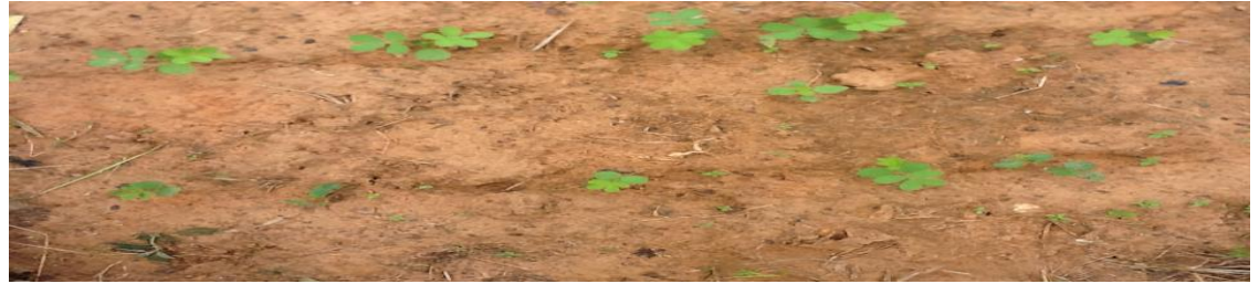
Fig. 4. Job opportunity; Phase (18 – 49 days after planting) to harvest senna obtusifolia leaves for human delicacy (Tafasa food).

Treatments consisted of three intra-rows spacing; narrow-row (10cm), medium-row (25cm) and widerow (50cm) and constant inter-row spacing (50cm), the experiment was thoroughly monitored for over five months (figs. 4-9, table 1). Senna obtusifolia seeds were obtained in November, 2016 raining season from the premises of Federal College of Education (Technical) Bichi. The seeds were scarified in hot water for three minutes before planting (Abdulazeez, 2016). Four seeds were planted per hole and thinned to one stand per hole two weeks after sowing, seeds were planted by hand in 1cm deep furrows for all the treatments. There were four ridges for each treatment, a ridge was 300cm long and 50cm apart, all treatments (sub-plots) were replicated three times in a randomized complete block design (RCBD). Weeds were controlled by hand hoeing twice, first at three weeks after emergence with second weeding at four weeks after the first weeding. First manual fertilizer application (3g/plant) was four weeks after emergence with second application at four weeks after the first application as top dressing.