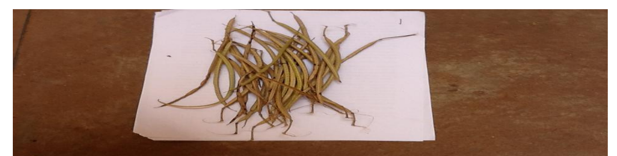
Fig. 7. Number of pods yield (32) of senna obtusifolia plant from narrow intra-row spacing of 10cm between plants.