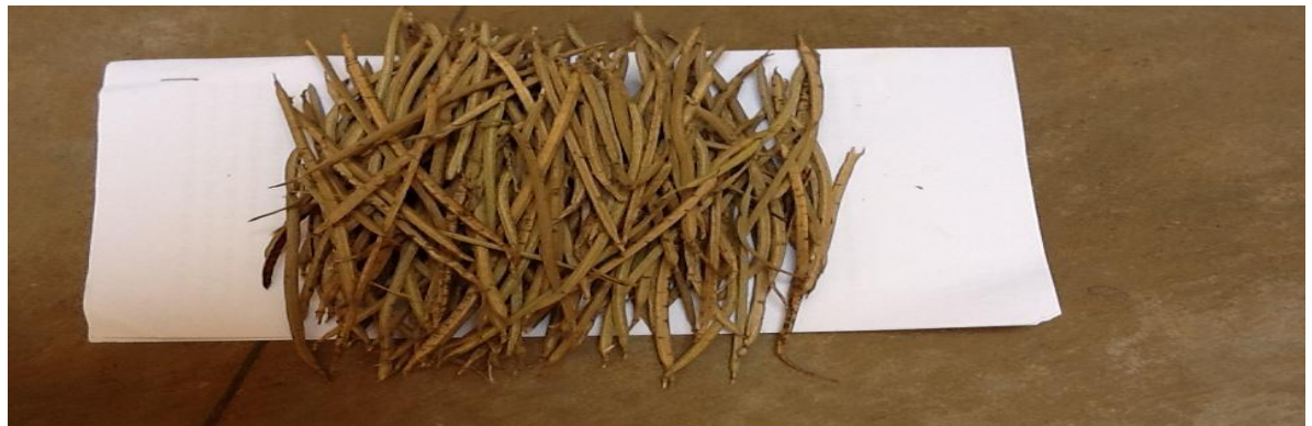
Fig. 9. Number of pods yield (221) of senna obtusifolia plant from wide intra-row spacing of 50cm between plants.

Table 1: Over five months biological characteristics observed in senna obtusifolia economic plant indigenous to Bichi, Sudan Savannah, Nigeria, at optimum intra-row spacing of 50 cm between plants.