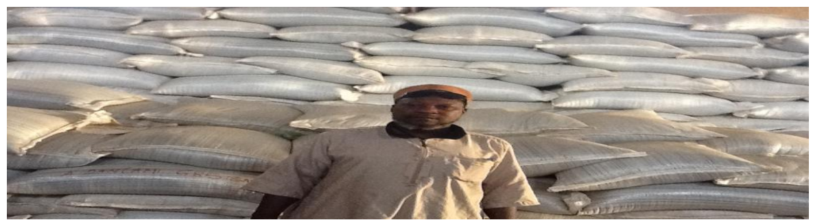
Fig. 3. Job opportunity; Senna obtusifolia seeds packed in sacks for export at Dawanau International market, Kano state, Nigeria. January 4, 2017.