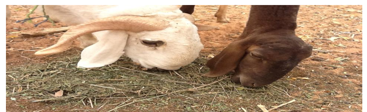
Fig. 1. Job opportunity; Sheep feeding on shade dried senna obtusifolia plants, harvested 84 days after planting.

maggi, (fig. 2), and matured seeds are packed in sacks for export (fig. 3). Traditionally and commercially, senna obtusifolia is not grown in Nigeria, both the leaves and seeds are presently harvested from the wild. There is limited research conducted on the effect of intra – rows spacing on growth, yield and biological characteristics of senna obtusifolia. In considering the above facts, there is the need to search for appropriate agronomic intrarow spacing for senna obtusifolia plant; to enhance livestock feed production, further research, profitability and economic diversification in tropical countries.