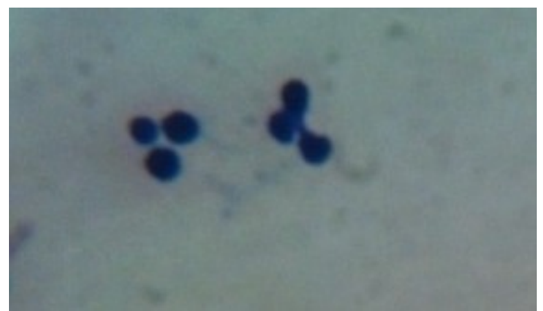
b- Dinucleus Figure (1) Types of Mitotic index a- Mononucleus b- Dinucleus