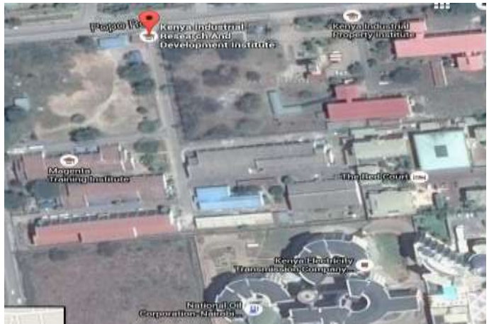
Figure 1: Site map of KIRDI tannery

Chromium contaminated chrome shavings waste samples were collected from the disposal site around tannery located at Kenya Industrial Research and Development Institute (KIRDI) and also from a tannery in Dandora between November-December 2014. The samples were collected in sterile plastic containers and transported to the laboratory for bacteriological analysis. The site map for the tannery at KIRDI is shown in figure 1 below.